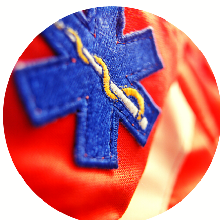
EMERGENCY MEDICAL TECHNICIAN (EMT)