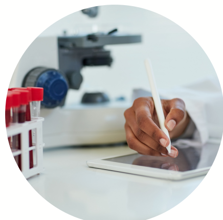
COMMUNITY HEALTH SCIENCE