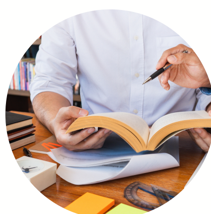
TEACHING & TRAINING